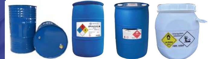
Dimethicone Oil 180kgs, Methyl Salicylate 250kgs, Methanol 250kgs, Calcium Hypochlorite 45kgs