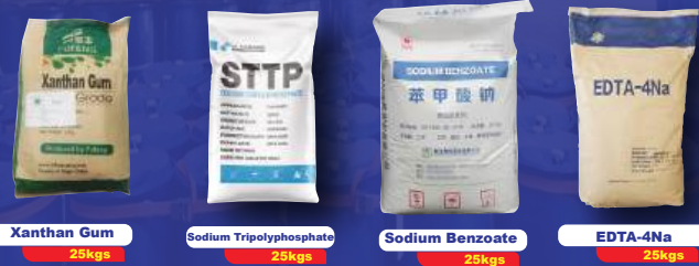
Xanthan Gum 25kgs, Sodium Tripolyphosphate 25kgs, Sodium Benzoate 25kgs, EDTA-4Na 25kgs