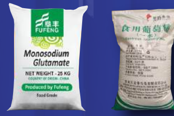
Monosodium Glutamate 25kgs, Dextrose Monohydrate 25kgs