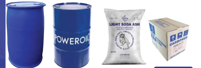
Monoethanolamine 250kgs, White Oil 180kgs, Soda Ash 25kgs, Carboron 25kgs