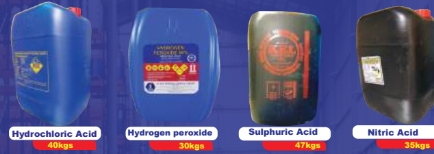
Hydrochloric Acid 40kgs, Hydrogen peroxide 30kgs, Sulphuric Acid 47kgs, Nitric Acid 35kgs