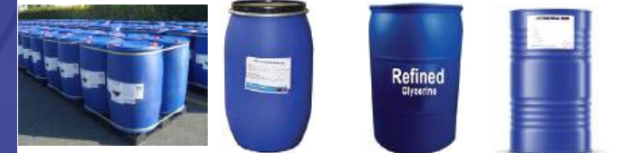
LABSA 250kgs, SLES 250kgs, Glycerine 250kgs, Acetone 180kgs

We work with you to optimize your supply chain and reduce costs through strategic sourcing, inventory management, and process optimization. Our supply chain solutions are designed to enhance efficiency, minimize waste, and improve overall operational performance.