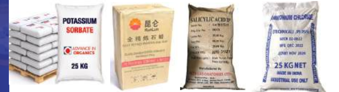
Potassium Sorbate 25kgs, Paraffin Wax 25kgs, Salicylic Acid 25kgs, Ammonium Chloride 25kgs