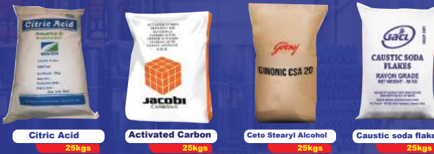
Citric Acid 25kgs, Activated Carbon 25kgs, Ceto Stearyl Alcohol 25kgs, Caustic soda flakes 25kgs